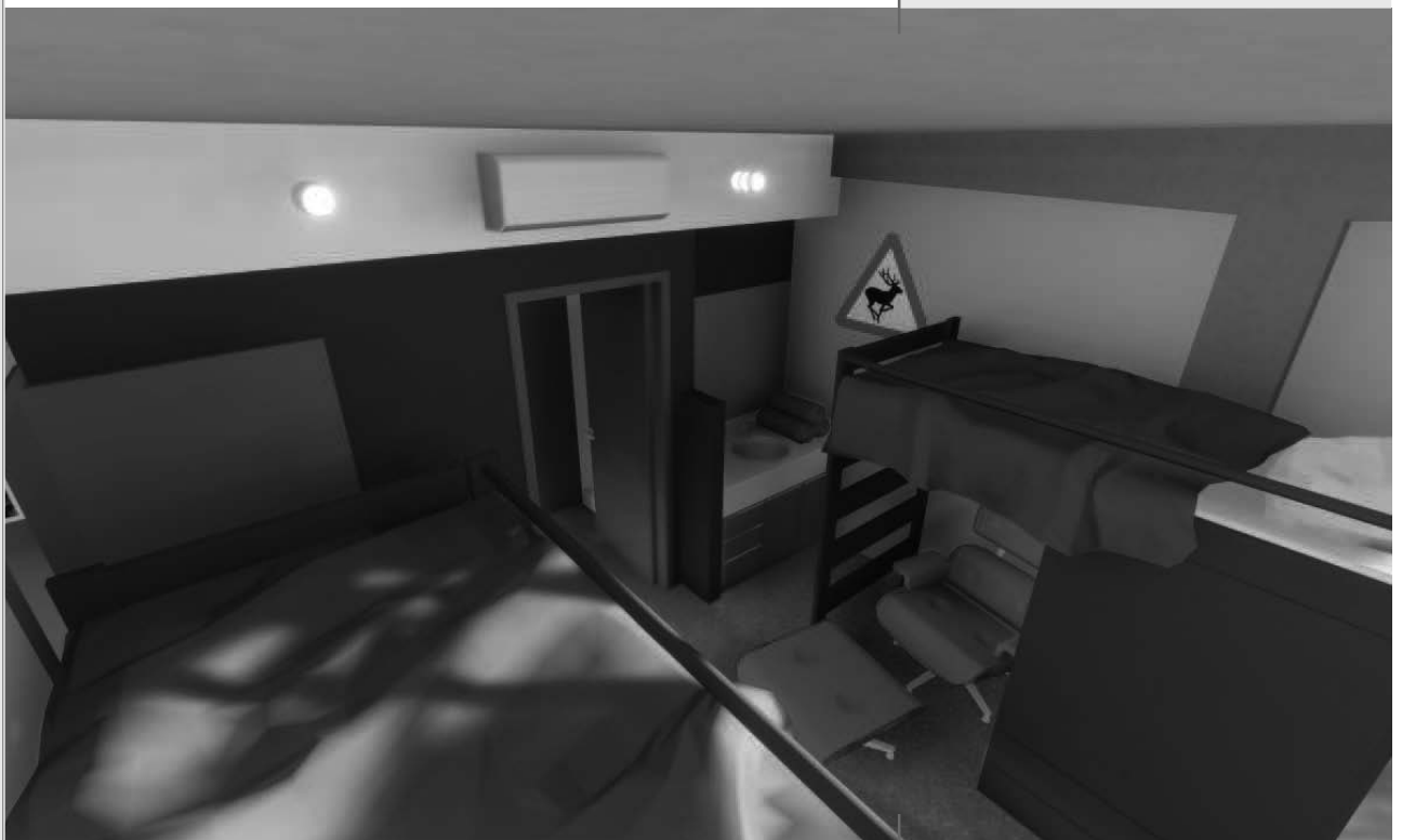
BEDROOM & PRIVATE BATH