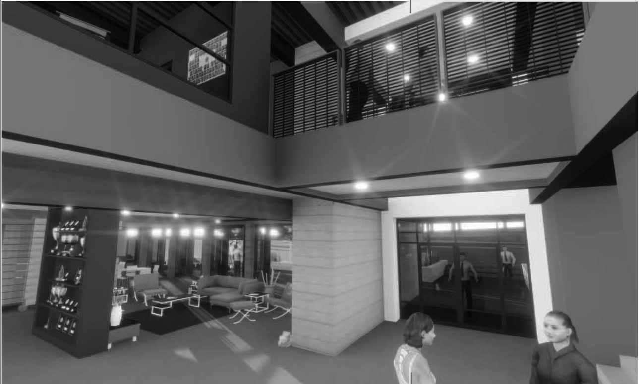
LOBBY - SKYWALK