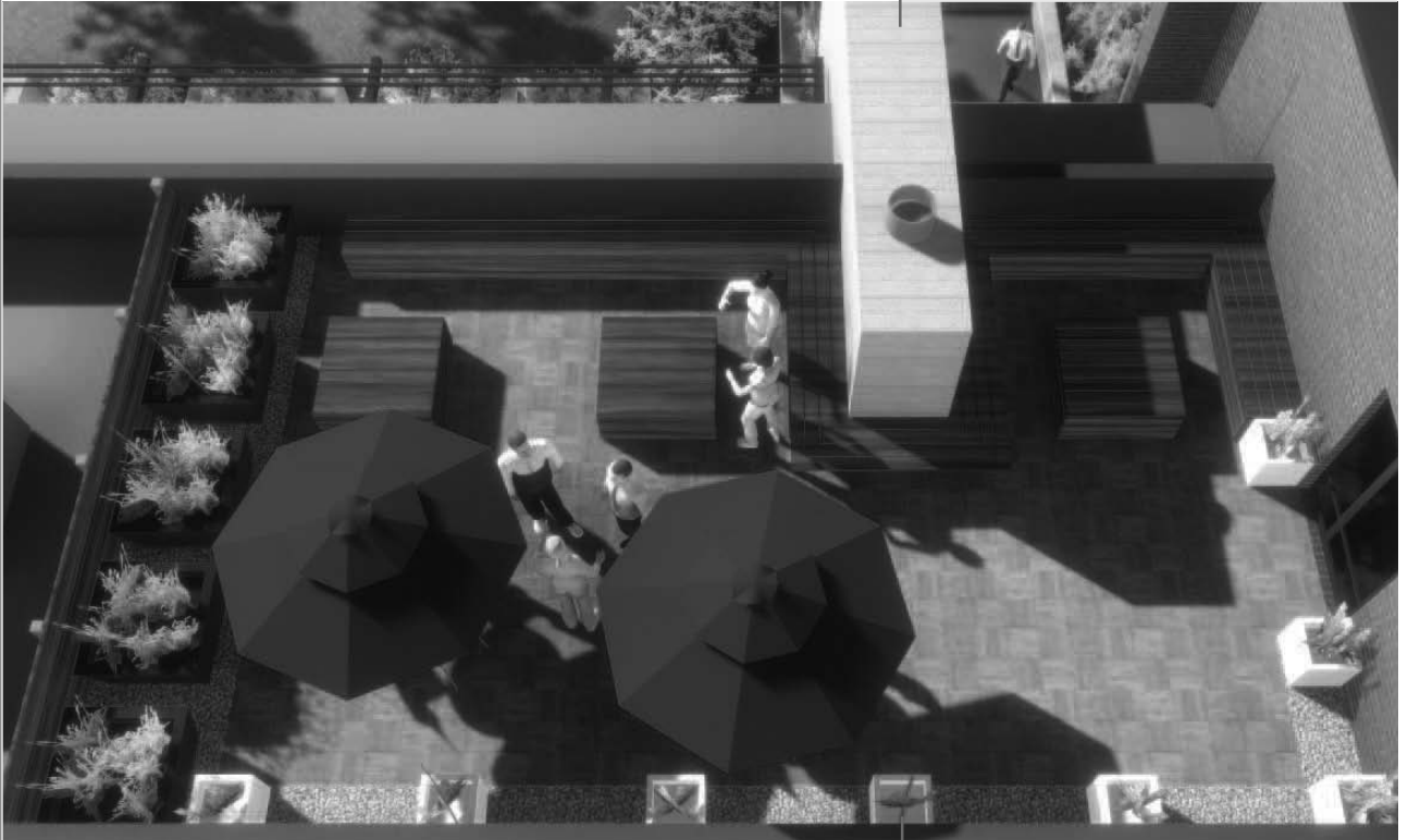
ROOFTOP GARDEN - AERIAL