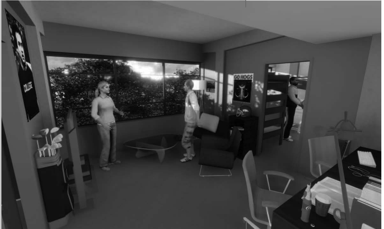
STUDY AREA - TYP. 4 MAN SUITE