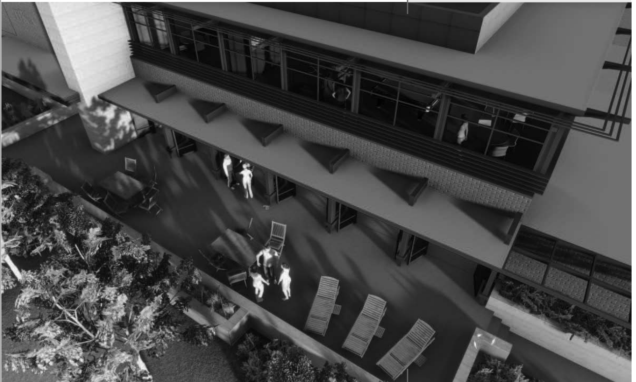
PATIO - AERIAL